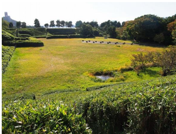
Figure 2. Research site